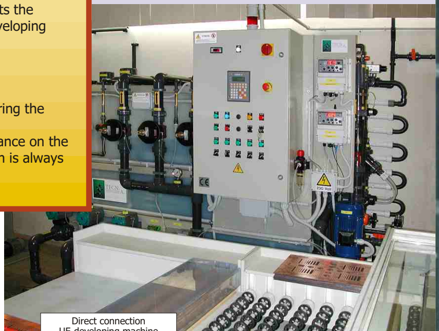
Direct connection UF-developing machine