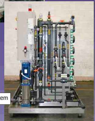
Automatic spongeballs system