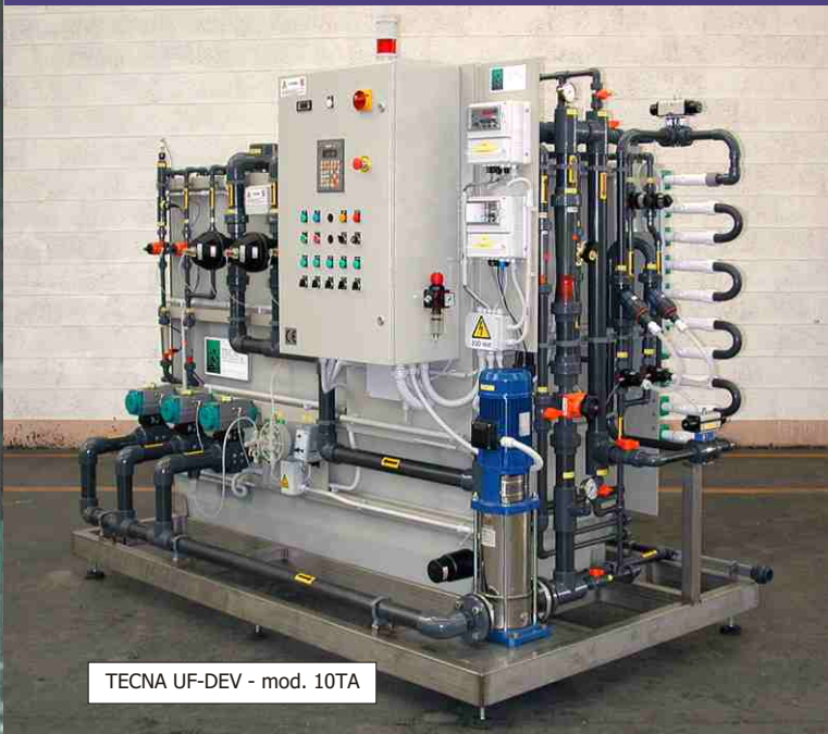
TECNA UF-DEV - mod. 10TA